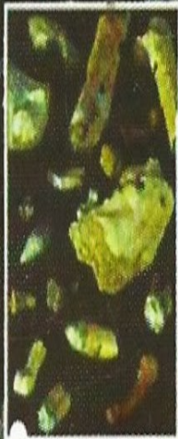
Ardipithecus kadabba ; Western Margin, Middle Awash