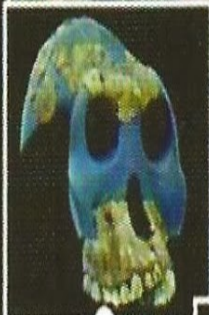
Australopithecus garhi ; Bouri Hata, Middle Awash