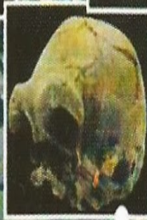
Homo ergaster ; Bouri Daka, Middle Awash