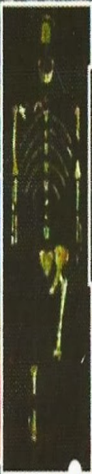
Australopithecus afarensis ; "Lucy", Hadar